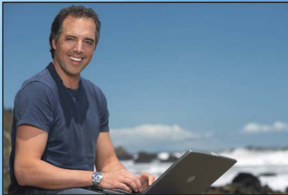
Blue Zones Founder Dan Buettner